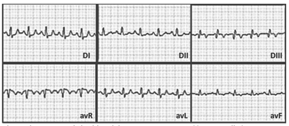
Fig.1. Normal electrocardiographic tracings of a healthy adult conscious guinea pig ( Cavia porcellus ) using a computerized ECG. Tracings were recorded in six derivations of the frontal plan, with 50mm/s of velocity and sensitivity of 1cm=2mV (2N).

QT interval duration was 123.9, ranging from 107.7 to 140.1ms, on lead II (Table 2), with no relation to the body weight (P \leq 0.05) (Table 4). A high correlation was detected